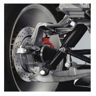
SLA REAR SUSPENSION

Great athletes maintain core strength. So do great