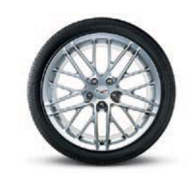
ZR1: 20-spoke aluminum wheel. Sterling Silver painted standard; available in chrome (shown) or Competition Gray. Size 19" x 10" front, 20" x 12" rear.

ZO6: 10-spoke spider aluminum wheel. Silver painted standard; available in chrome and Competition Gray (shown). Size 18" x 9.5" front, 19" x 12" rear.