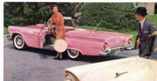
On the Main Street in Hometown, on the Champs Elysees in Paris . . . you're proud to be seen in a Thunderbird.