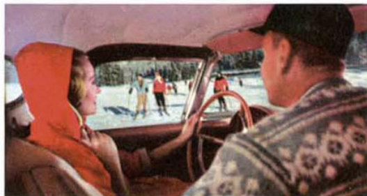
Town-car comfort and complete convenience guarantee that every season is the season for Thunderbird fun.