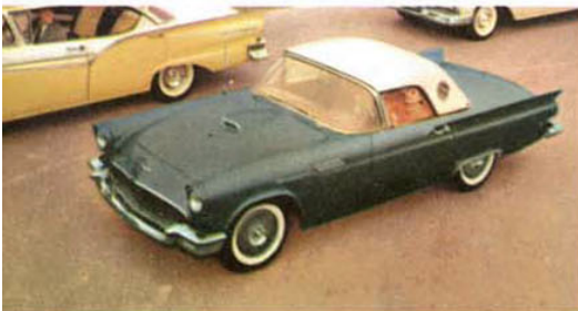
As light in traffic as a feather to your touch . . . a Thunderbird actually makes city driving fun!