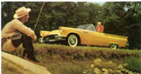
High roads, low roads, back roads—the rugged Thunderbird cheerfully follows your fancies.